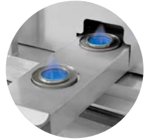
CANNED FUEL ADAPTER PACKAGE*

*Only available on specific models. Consult specification sheet or factory.