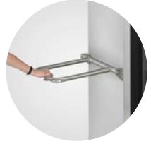
DROP DOWN HANDLE