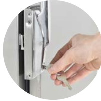
KEYLOCKING DOOR LATCH