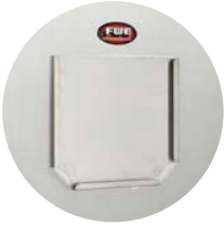
MENU CARD HOLDER