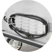
CORD WINDER BRACKET