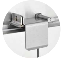
PADLOCKING TRANSPORT LATCH