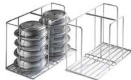
FOR COVERED PLATES (CP)