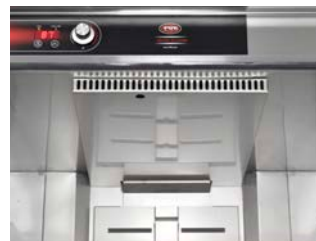
Blower Motor and Baffle System

The Top Mount heat system utilizes a blower motor inside the top of the cabinet to eliminate cold and hot spots. This frees up room at the bottom of the cabinet, meaning there is more space for your food and ultimately leads to lower cleaning and maintenance costs.