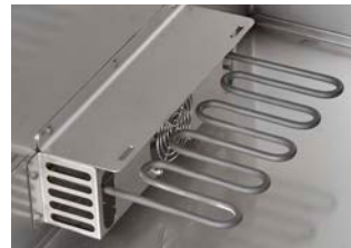
Heating Element and Blower Motor