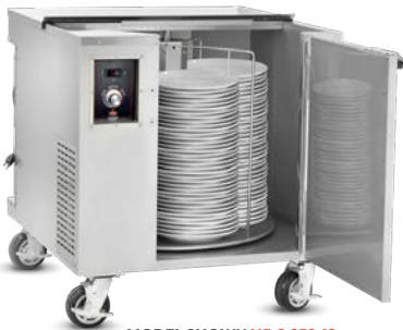
MODEL SHOWN HDC-252-12

If you need to keep your plates warm, then add this Heated Dish Cabinet to your banqueting order! With fast heat up times and more consistent plate temperature, you will be able to serve more customers faster with this cabinet. With adjustable wire rods, you can create up to four compartments to protect your plates while in storage or transport. Additional dish dolly models are available.