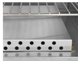
Heating Element with Vented Cover

Soft, radiant, and uniform are the words that best describe the Radiant Heat system. Air is naturally circulated and distributed by radiating heat from the element. Through natural convection, these cabinets are able to achieve uniform heat distribution without the use of a blower motor system.