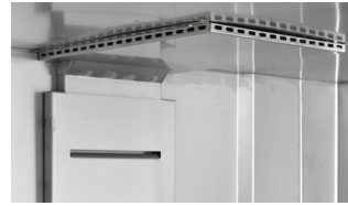
Blower Motor and Baffle System

Designed with mobility in mind, the Dual Heat system's versatility is nearly unmatched. Utilizing both canned and electric heat, Dual Heat cabinets can keep your food warm without power while you move from the kitchen to your destination. In electric mode, the cabinet distributes heat using a top mounted blower motor while the element radiates heat from the bottom. In canned fuel mode, heat rises from the canned fuel compartment in the bottom of the cabinet.