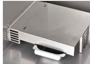
Humidity Pan and Cover

Developed to eliminate cold and hot spots, the Humi-Temp heat system preconditions the environment by gently circulating hot, moist air throughout the cabinet. With a water pan located at the bottom of the cabinet, you have the ability to add humidity to the banquet cabinet so you can keep your food hot and fresh for hours. A bottom mounted blower motor works together with a heat tunnel to evenly distribute heat and moisture. Moist air prevents dry-out when using uncovered plate carriers (UP).