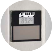
SOLAR DIGITAL THERMOMETER*