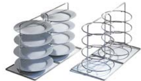
FOR UNCOVERED PLATES (UP)

FWE offers both Covered and Uncovered plate carriers for most of our banqueting cabinets. Be sure to specify if you need Covered or Uncovered when ordering. Please consult our factory about your needs.