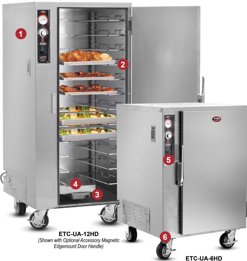
ETC-UA-12HD (Shown with Optional Accessory Magnetic Edgemount Door Handle)

Economy Universal Server keeps bulk foods hot, moist and oven fresh