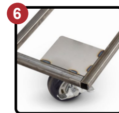
Built For Transport