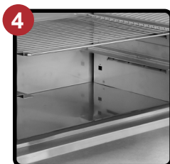
Open Bottom Base