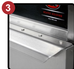
Magnetic Workflow Door Handle