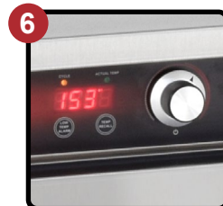
User Friendly Electronic Controls