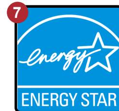
Energy Star Approved