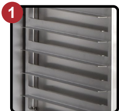
Versatile Fixed Rack