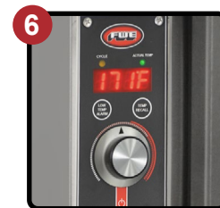
6 Electronic Controls