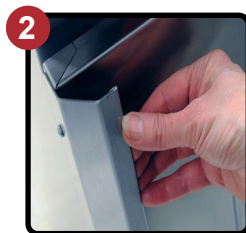
2 Magnetic Workflow Door Handle