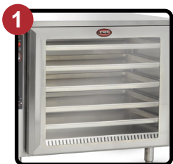
1 See-Thru Lexan Door (standard on countertop models)