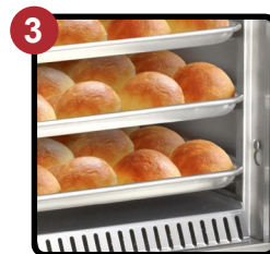
3 Keeps Food Hot and Fresh