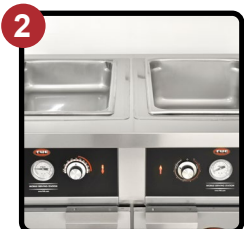
Separately Controlled Wells