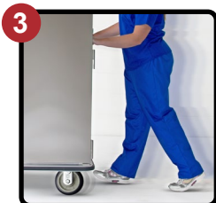
Made for Transport