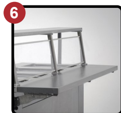
Optional Sneeze Guard & Tray Shelf