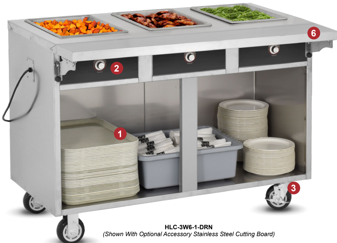
HLC-3W6-1-DRN (Shown With Optional Accessory Stainless Steel Cutting Board)