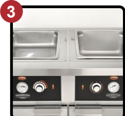
Separately Controlled Wells