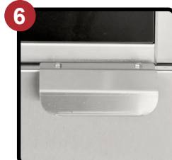
Work Flow Handle