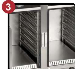
Separately Controlled Compartments