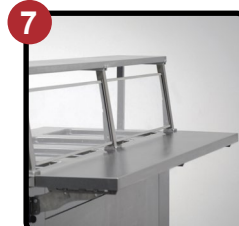
Optional Sneeze Guard & Tray Slide Shelf