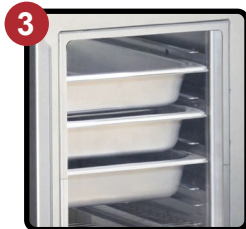
Convenient Fixed Rack Assembly