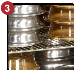
Heavy-Duty "No Sag" Shelves