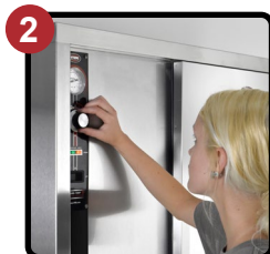
Eye Level Control Panel