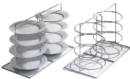
UP carriers hold Uncovered Plates