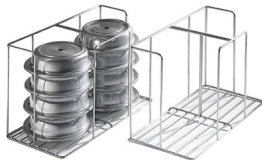
CP carriers hold Covered Plates