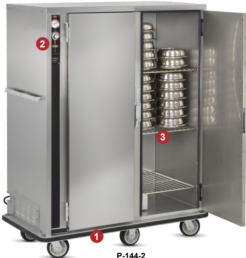
PLATE CARRIERS AVAILABLE