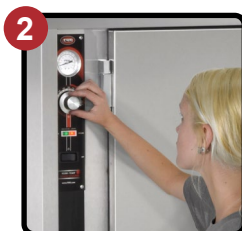
Eye Level Control Panel