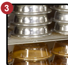
Heavy-Duty "No Sag" Shelves