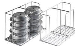
CP carriers hold Covered Plates