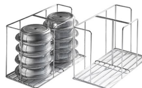
CP carriers hold Covered Plates