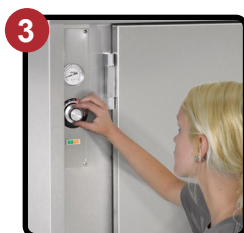
Eye Level Control Panel