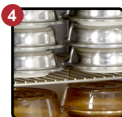
Heavy-Duty "No Sag" Shelves