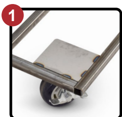
Tubular Welded Base Frame