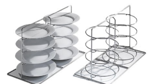
UP carriers hold Uncovered Plates