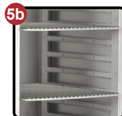
GN Fixed Rack