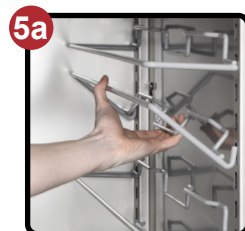
Adjustable Tray Slides