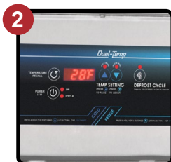
Dual-Temp Control Panel