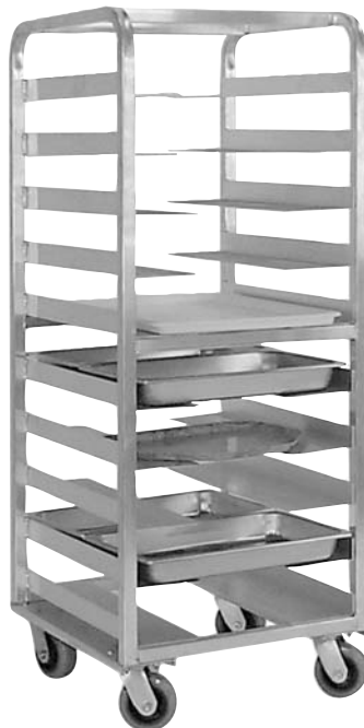
OTR-OT-06-10 Wide 6-3/8" tray ledge supports oval trays