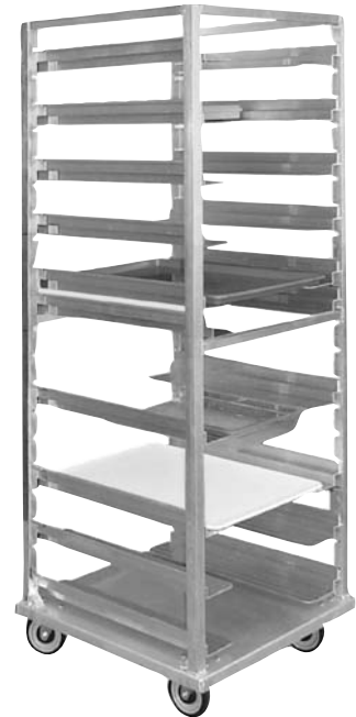
OTR-UA-13 Universal Adjustable Rack

Economical and functional aluminum racks for transport, bussing and storage.