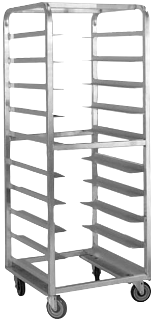
OTR-FUA-05-11 Universal Rack