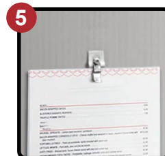
Menu Card Holder