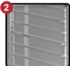
Fixed Tray Slides