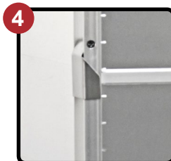
Gravity Door Latch