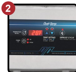
Dual-Temp Control Panel