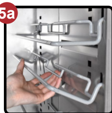
Adjustable Tray Slides