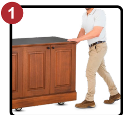
Made for Mobile Applications