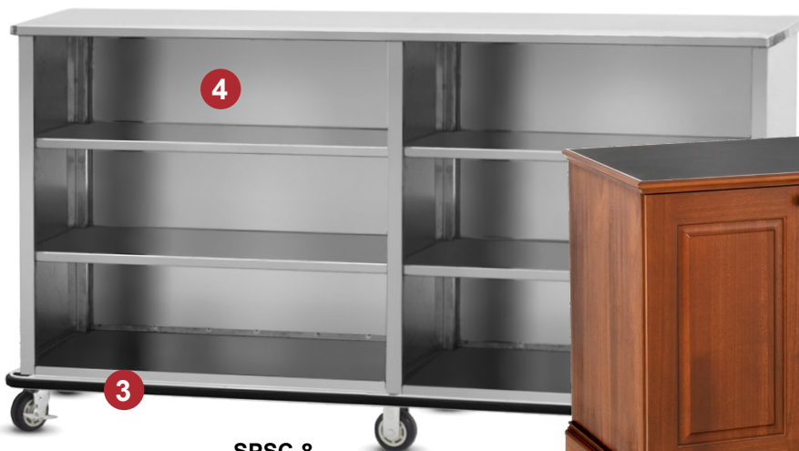
SPSC-8 WEATHER-ALL SERIES (STAINLESS STEEL)

Shown with Optional Accessory Full Perimeter Bumper