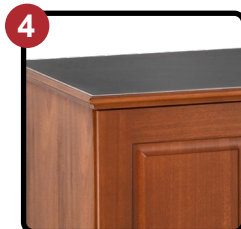
Easy to Clean Surfaces