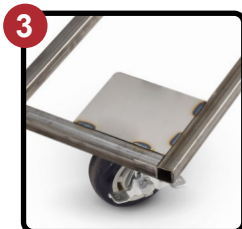
Tubular Welded Base Frame