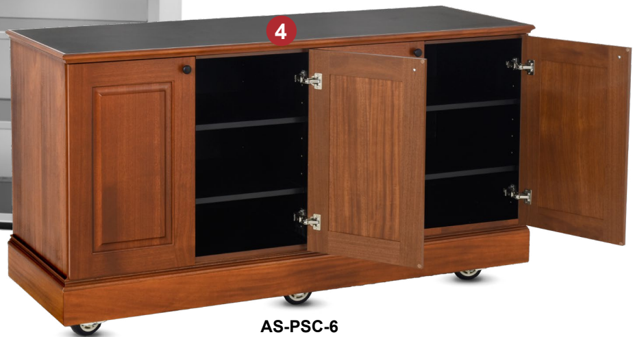
AS-PSC-6 ARCHITECTURAL SERIES (MAHOGANY WOOD)

Shown with Optional Accessory Full Perimeter Bumper