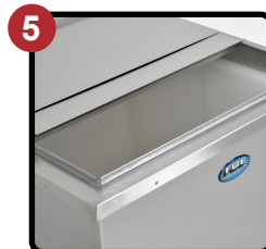
Stainless Steel Sliding Cover