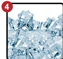
200lb Insulated Ice Storage