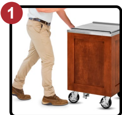
Made for Mobile Applications